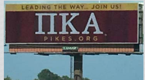
Pike Outdoor Board in Hattiesburg, MS during Formal Rush 2018 and Tent set-up across from The Pike House on fraternity row at USM.