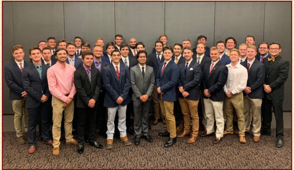
C urrent Membership of the Delta Mu Colony ready for initiation in the Spring of 2019.