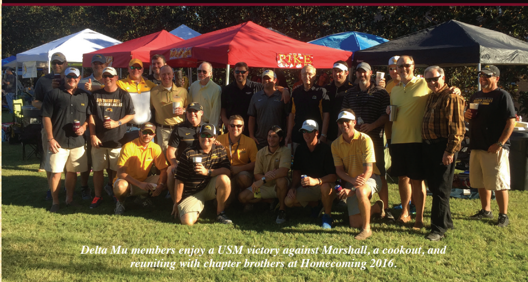
Delta Mu members enjoy a USM victory against Marshall, a cookout, and reuniting with chapter brothers at Homecoming 2016.